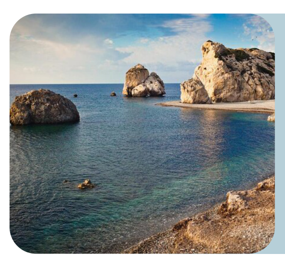
Petra tou Romiou

On our way to reach Paphos town, we will make a small detour so that we drive for a few minutes on the spectacular Limassol seaside road. Heading to Paphos we see on our left Pissouri village and in particular "Petra tou Romiou".